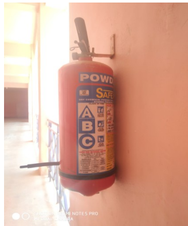
Fire extinguisher installed in the first floor of college building

Fire extinguishers are extremely important as they are the most common means for fire protection. These are installed in the college campus for fire safety. In many cases they are a first line of defence and often contain or extinguish a fire, preventing costly damage. They are checked and serviced periodically.