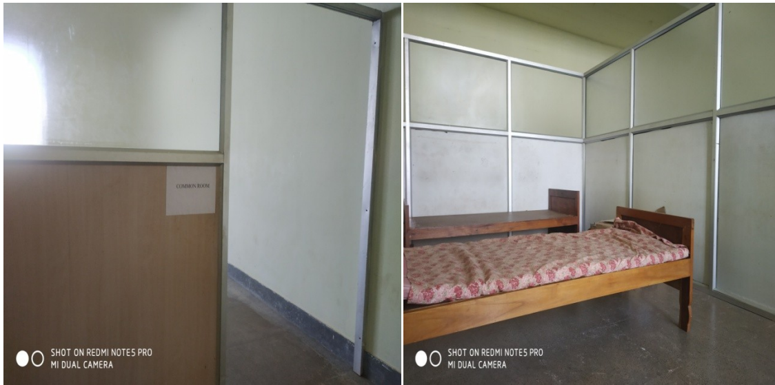
COMMON ROOM FOR GIRLS –GROUND FLOOR