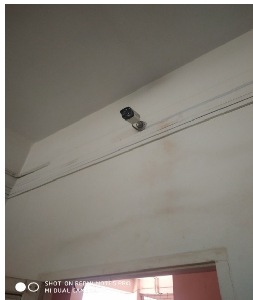
CCTV - COLLEGE OFFICE