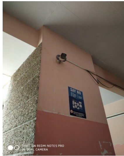
CCTV - GROUND FLOOR