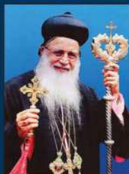
The Late H.H. Baselios Marthoma II Catholicos of the East & Malankara Metropolitan Founder Chairman