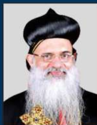
Chairman H.H. Marthoma Paulose II Catholicos of the East & Malankara Metropolitan (The Supreme Head of the Malankara Orthodox Church)